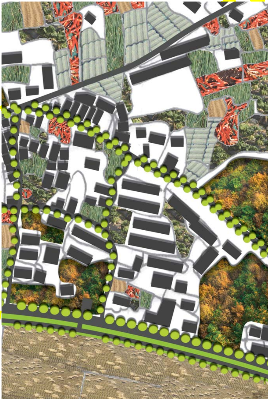
scale 1 : 1000