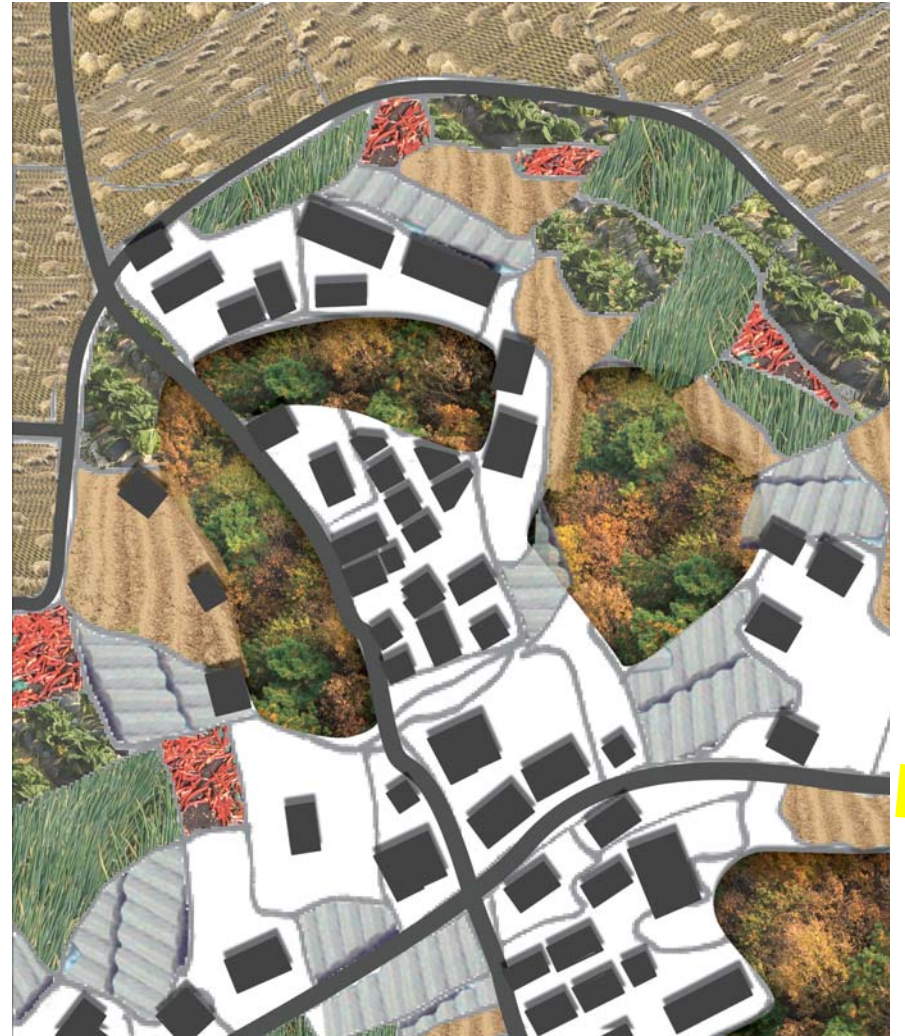
scale 1 : 1000