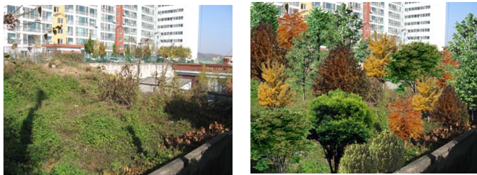
_ reforestation in open spaces