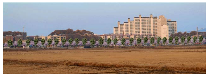
_ cityscape attenuated with vegetation