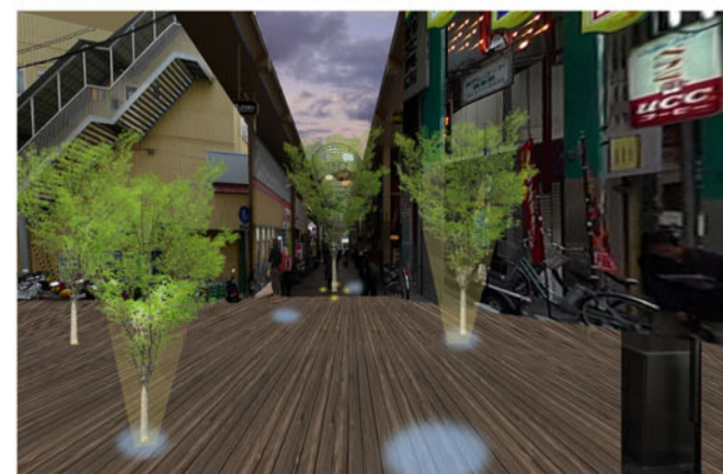
central place open the street, summer