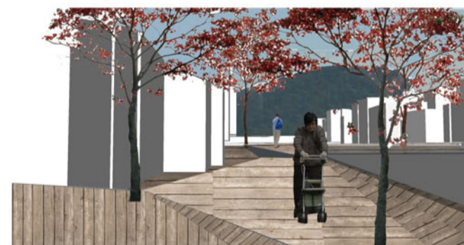
observatory to the Rokko mountain, autumn