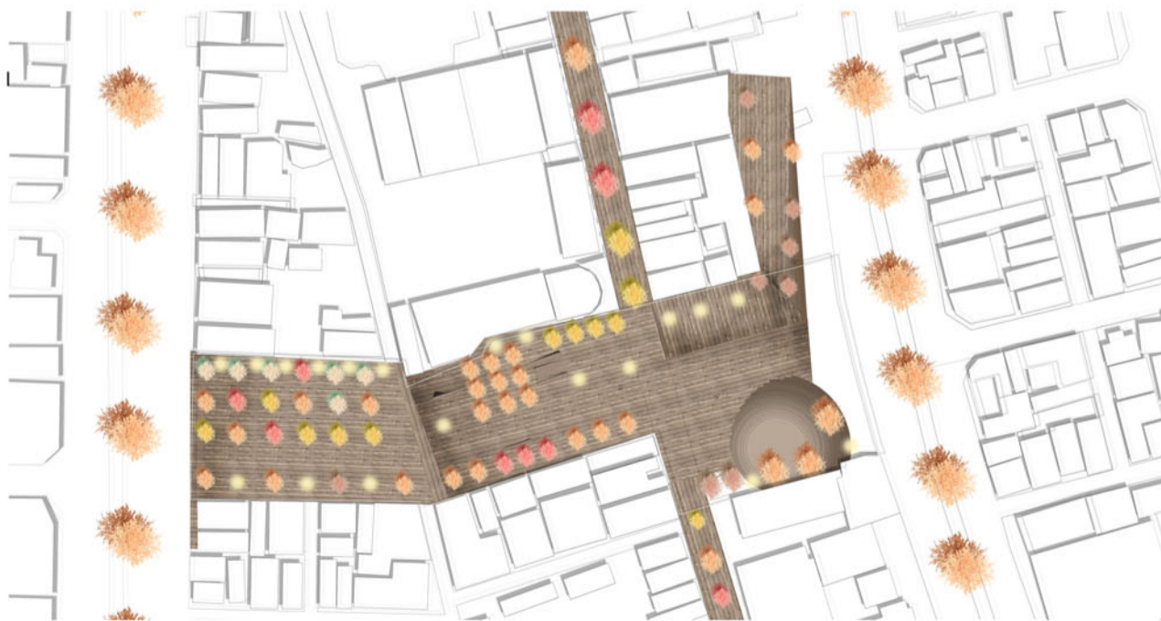
plan of central place, 1:500