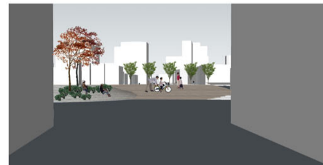
view from an alley, summer