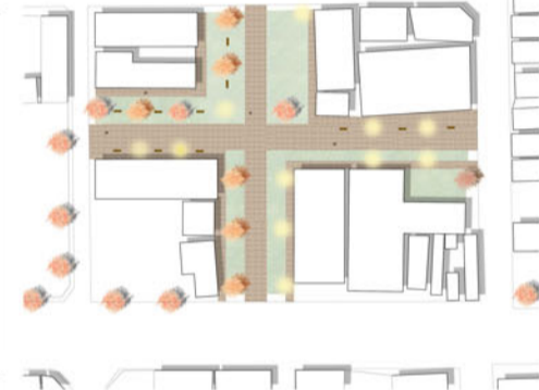
maple for the autumn